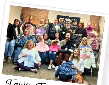
Equity Team Coats For Kids Fundraiser 2025

Wishing you and your loved ones peace, joy, and treasured moments this season.